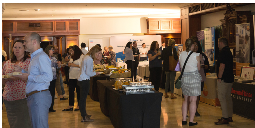
Delegates in the corporate sponsor area