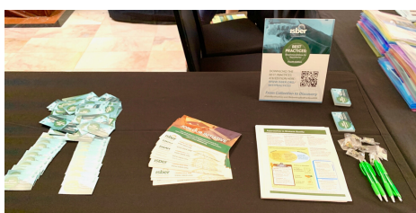
ISBER display at the Registration Desk