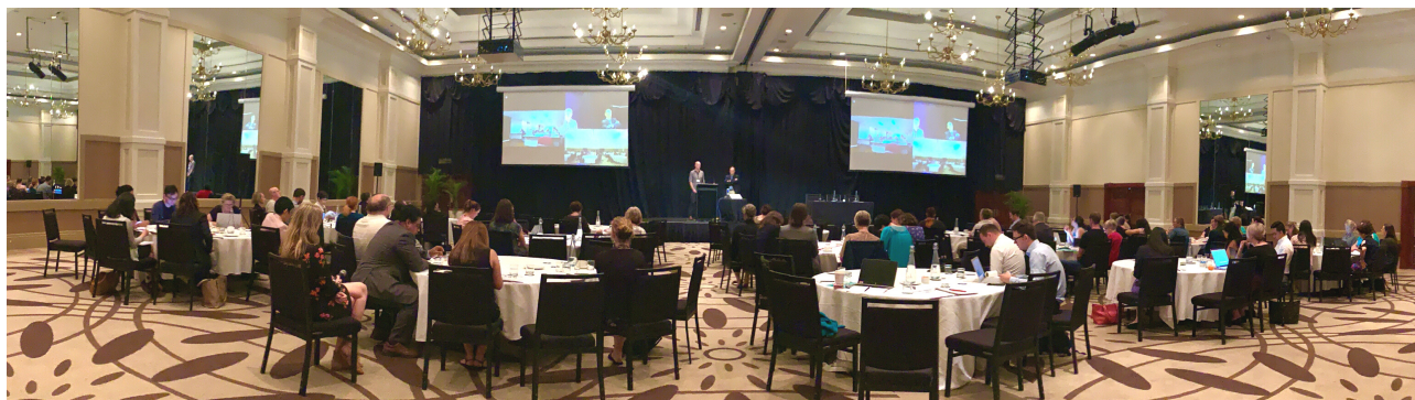
View of the Kuranda Ballroom, setting up for the live stream between ABNA and ANRRC